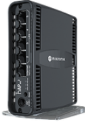
hAP ax 2